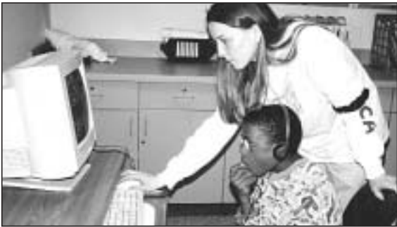
Rainbow Center for Communicative Disorders in Blue Springs. The Foundation provided support to purchase four computers and printers to be installed in the Center's new facility for disabled students.

Neighborhood Self Help Fund. $2,000 for requests for new funding from local foundations to be added to the Neighborhood Improvement Fund. This fund offers grants to small neighborhood projects that address problems within their community.