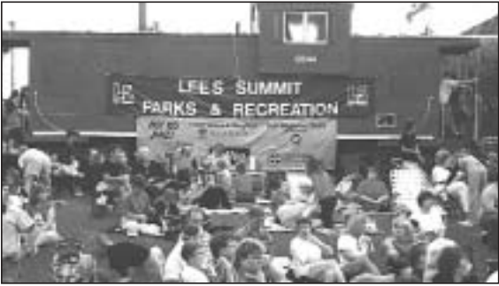
City of Lee's Summit Parks & Recreation. The Foundation provided grant support for the 2000 Summer Music Festival series. The events provided residents opportunities for community involvement and cultural awareness.